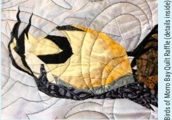
Birds of Morro Bay Quilt Raffle (details inside)